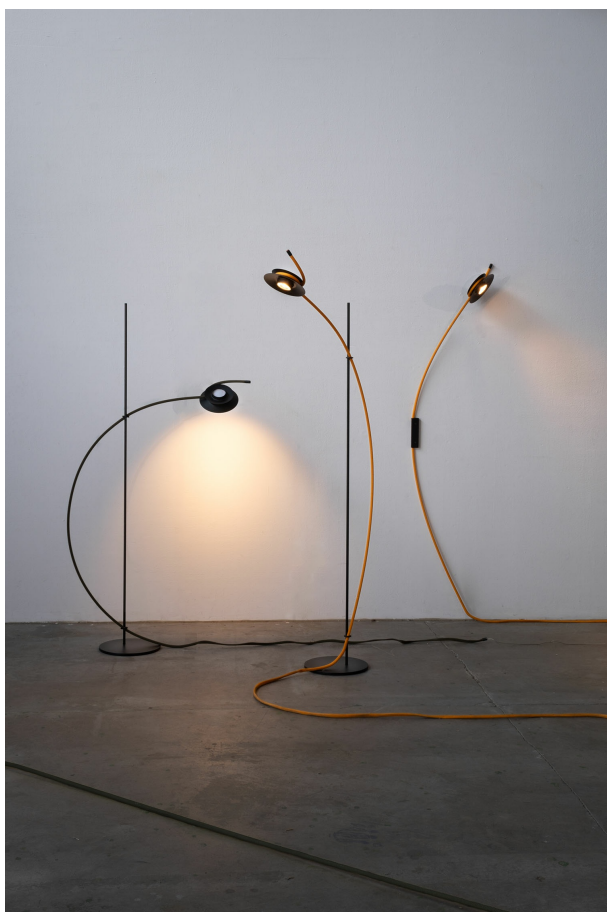
Ms. Bowjangles ANNA BOCH, DAVID ENGELHORN, 2023

The lamp gets its characteristic bend from a spring steel sheathed in coloured textile. The seemingly effortless rising orange rope dances around a metal rod about 1.40 meters high and ends in a striking shade with elegant and almost futuristic aesthetics. The moving nature of the luminaire is anchored in the constantly swinging construction. In the asymmetrical silhouette with clean lines and curves that interact dynamically, the rope seemingly wraps around the abatjour. Through an optical illusion, it appears as if the umbrella is held in place by the wrapping of the rope alone. On the underside of the shade is an LED light that provides a soft, warm white down light with the help of the built-in diffuser. The lamp comes up with an additional highlight: At the end of the "tail", the "Ms. Bowjangles" can be infinitely dimmed by touch.